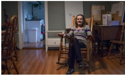
Ithaca house 'like a safe haven' for homeless and recovering women